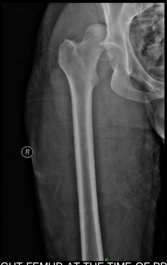
XRAY OF THE RIGHT FEMUR AT THE TIME OF PRESENTATION SHOWING POSTERIOR DISLOCATION OF HIP JOINT AND FEORAL HEAD FRACTURE.