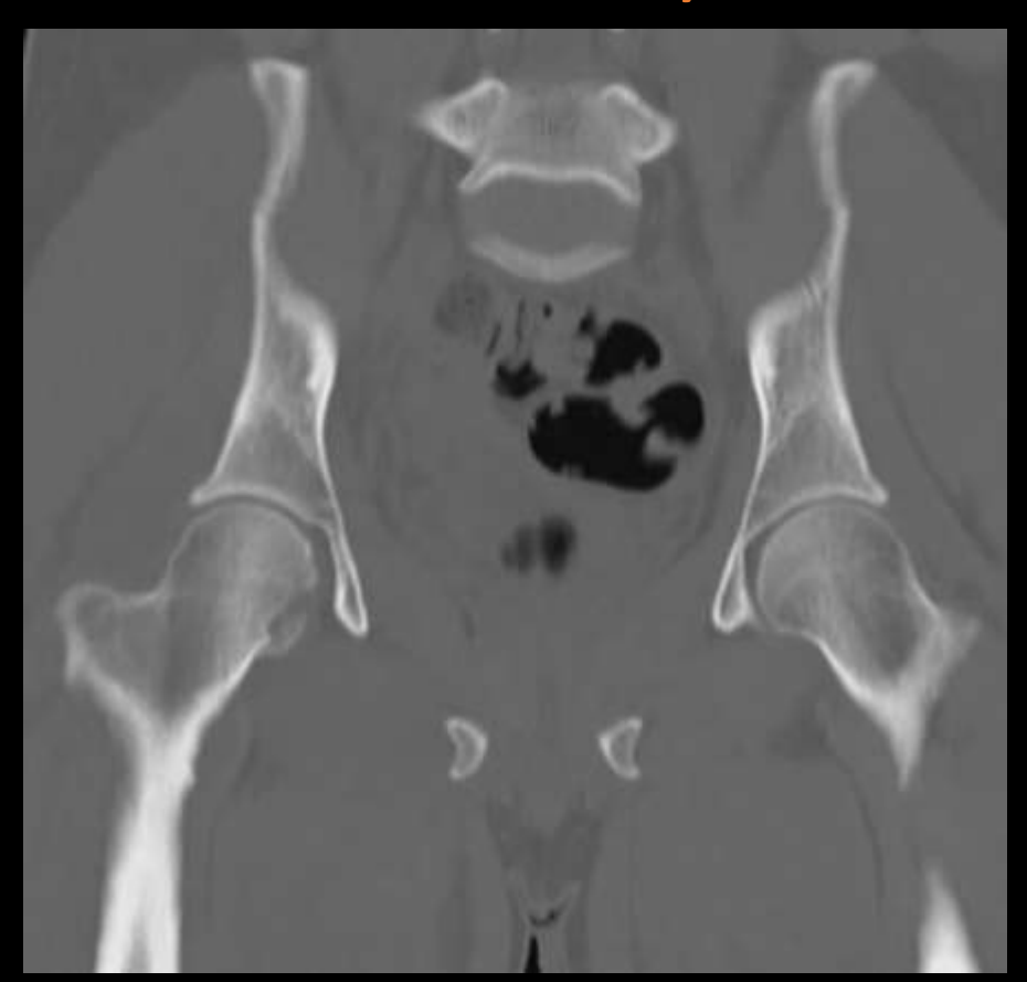
CHECK CT POST CLOSED REDUCTION.