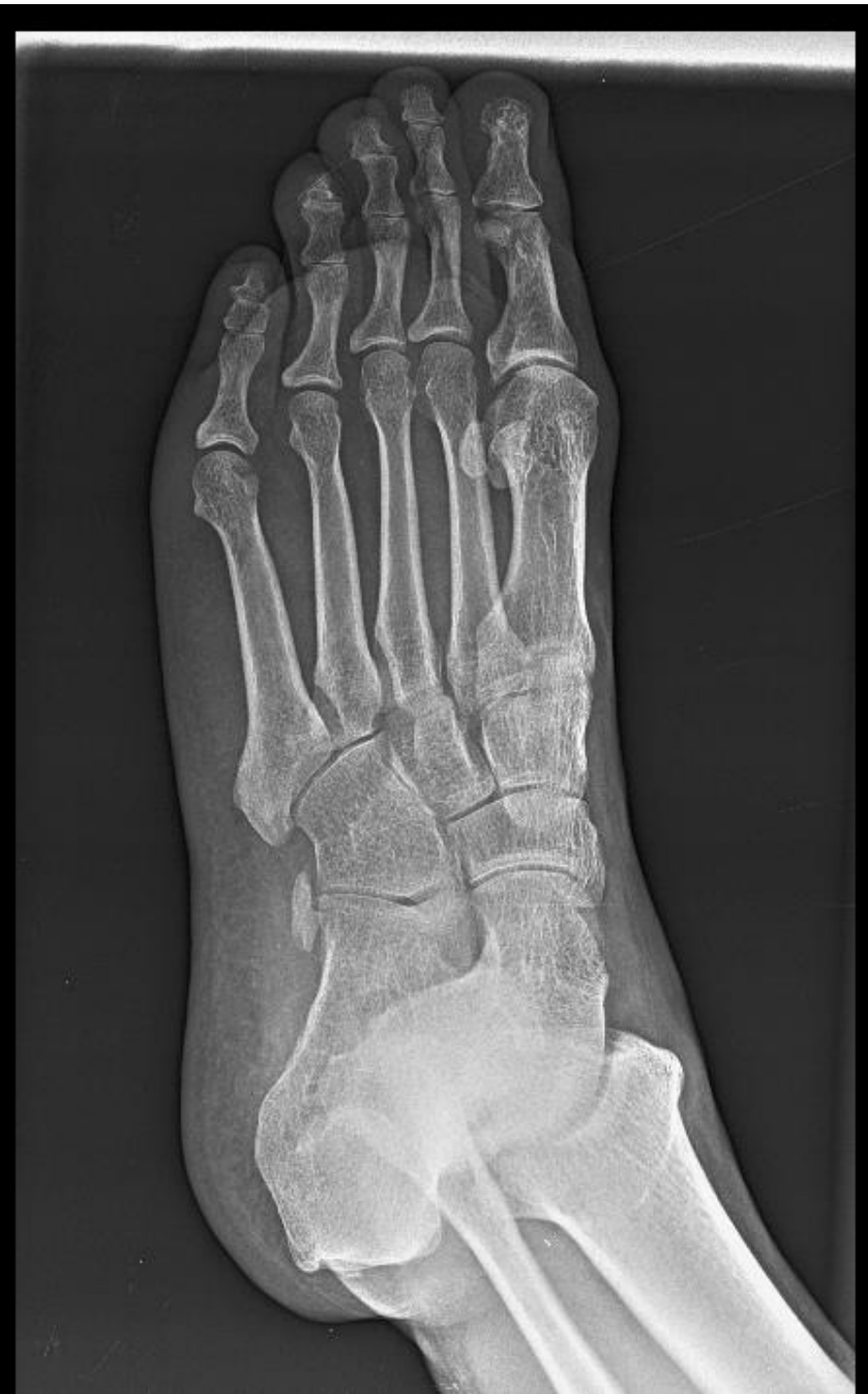
AP oblique radiograph of right foot.