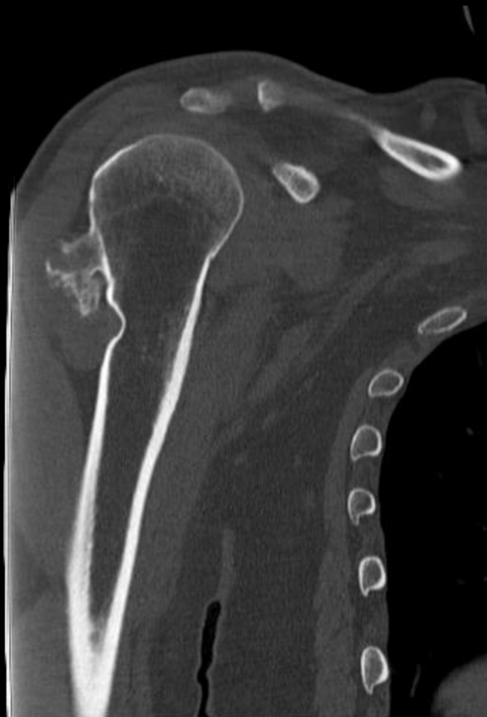
Coronal unenhanced CT